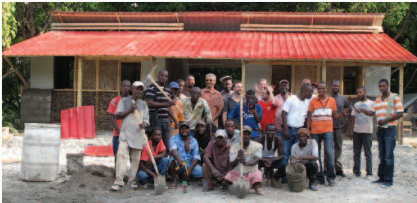
The team in Gressier. Caritas Austria