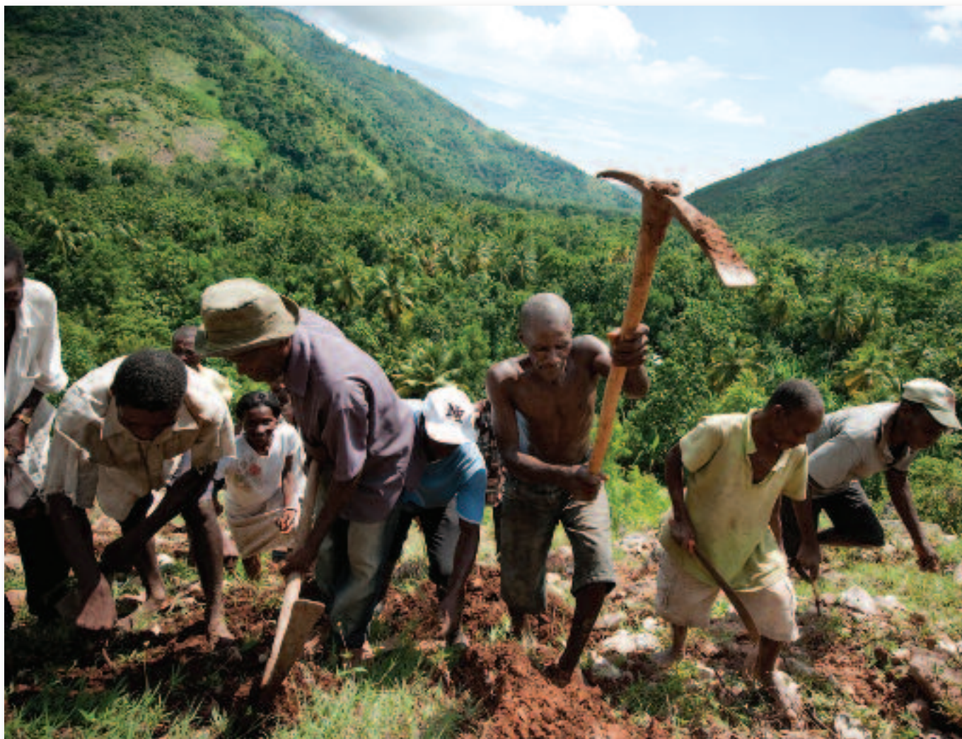
Elodie Perriot/Secours Catholique