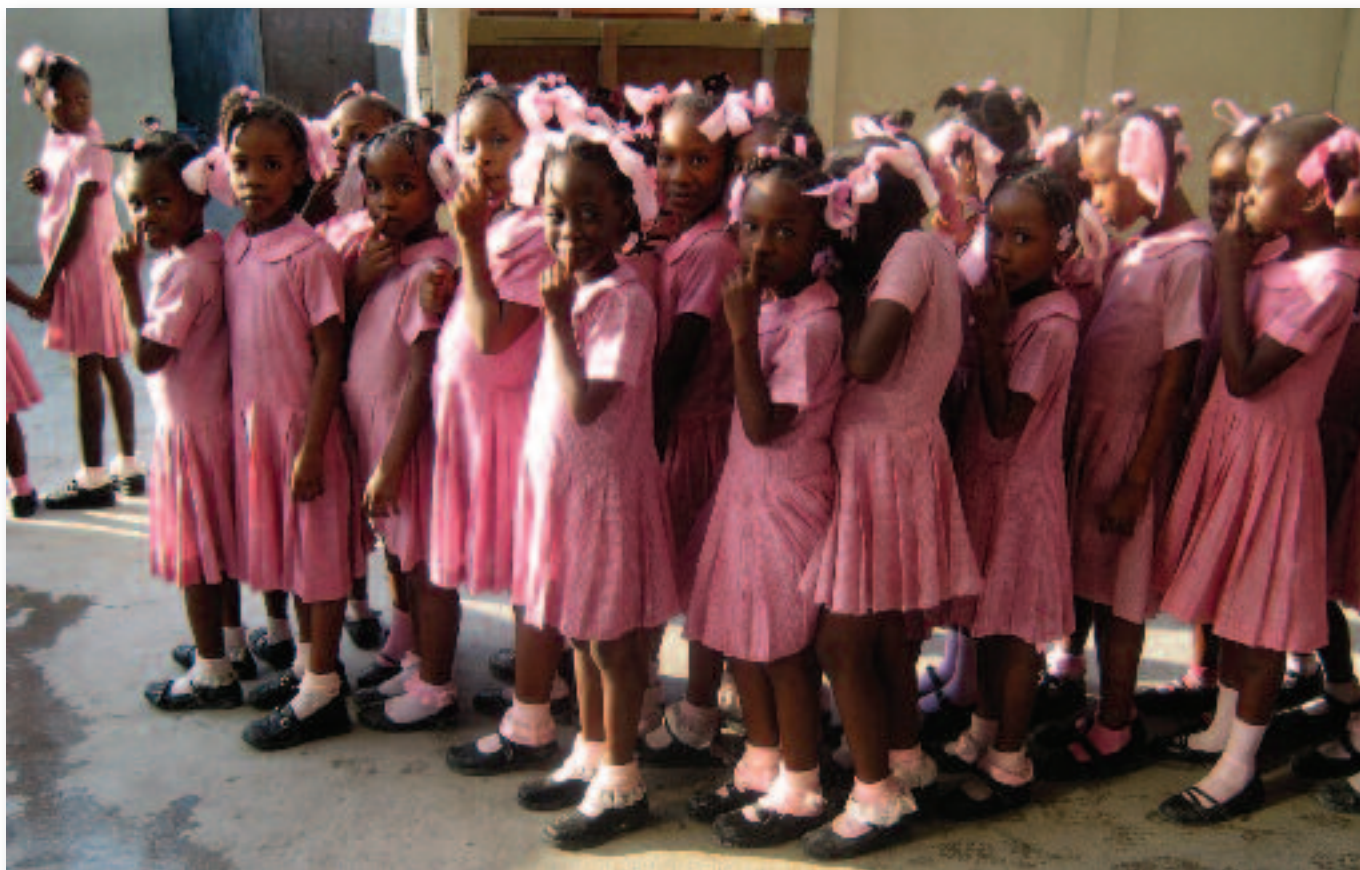
At École Marie-Esther in Port-au-Prince, pupils are lined up before a table piled high with plates filled with steaming rice and beans.