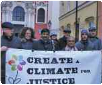
The launch of the Grow Climate Justice campaign at UN talks in Poznan.