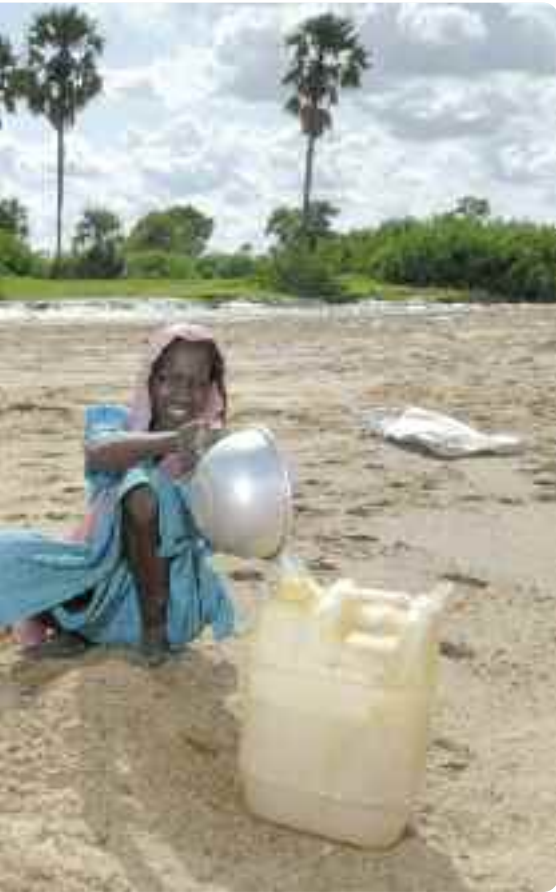
Girls scooping water from a hole they dug in the sand of a wadi in South Darfur.