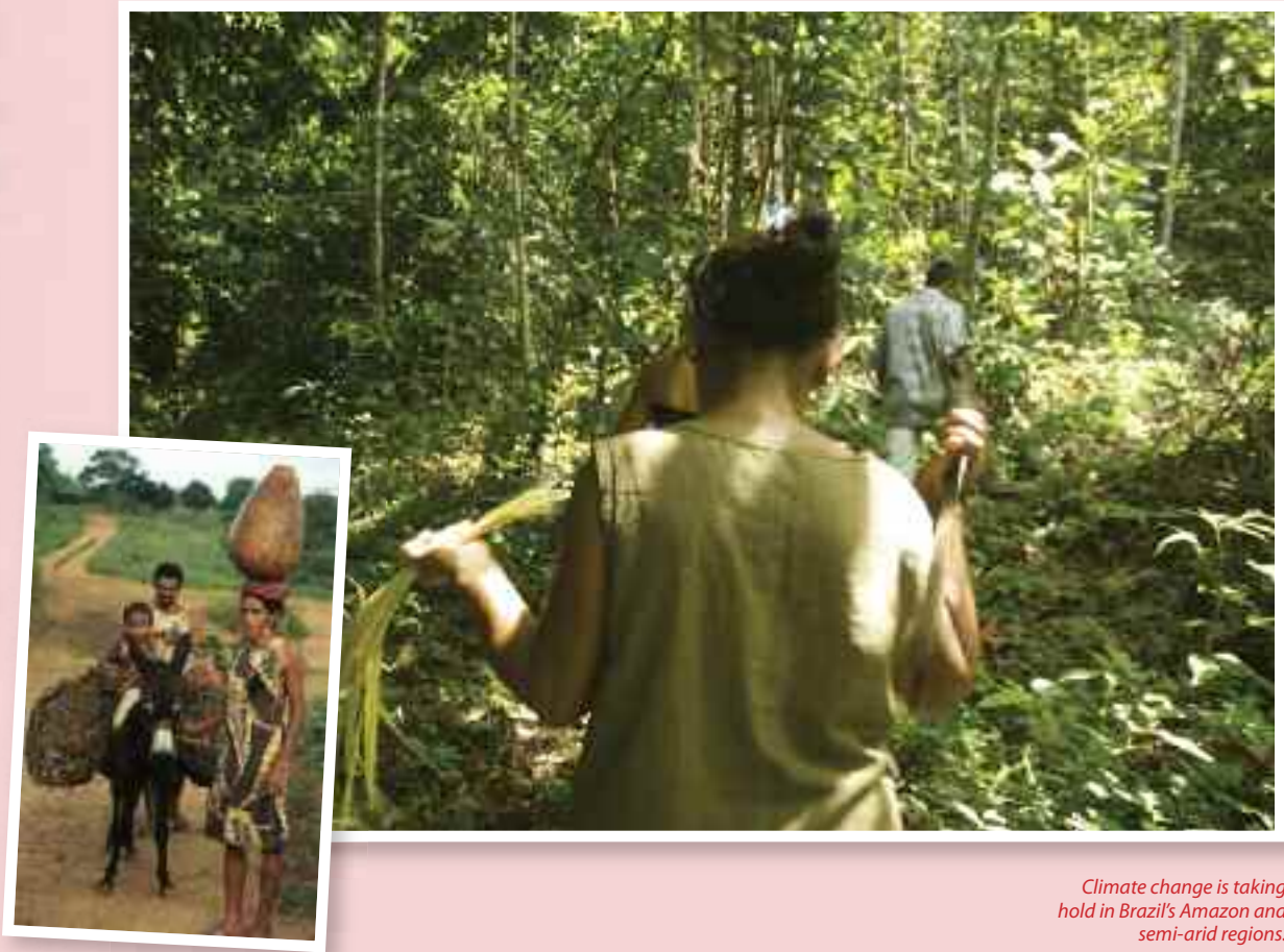
Climate change is taking hold in Brazil's Amazon and semi-arid regions.