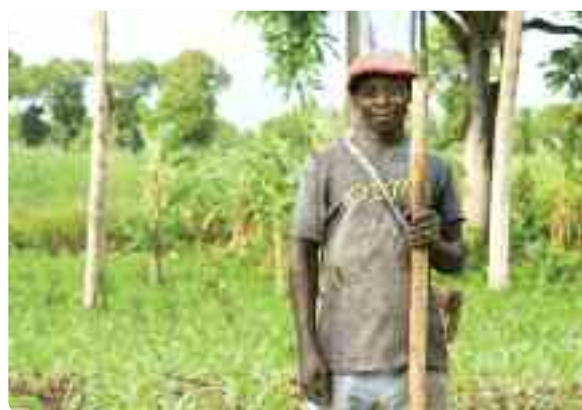
Caritas supports farmers in Haiti after the deadly 2008 hurricane season.

technological advancement for its own sake but rather that technology benefits people and enhances the land. 33 ○