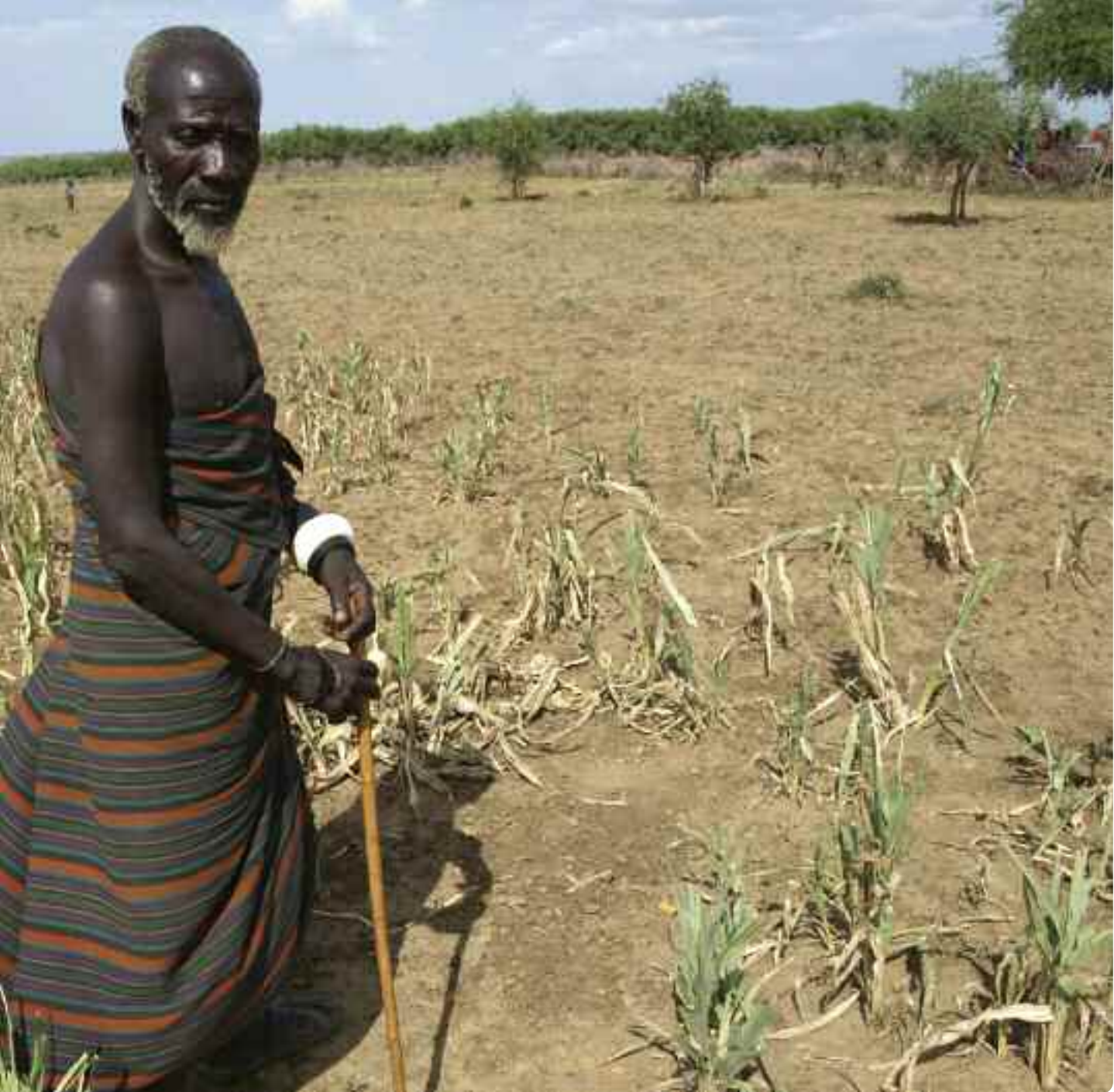
An elder surveys his scorched crops after failed rains in Northern Uganda in 2009.