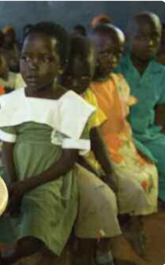
Worshippers at a Catholic Church near Kampala in Uganda offer maize instead of money during collection at Mass.

reveals the greatness of his works. Common to all of these is the notion of the shared presence of God in His creation, which is a gift that has been freely given. Men and women are to act on Earth as custodians and shepherds. They hold a responsibility for creation in trust, and are to “cultivate and take care” of it (Gen 2,15). However, the ultimate knowledge of creation, its origin and starting-point lies with God (Job 38-39).