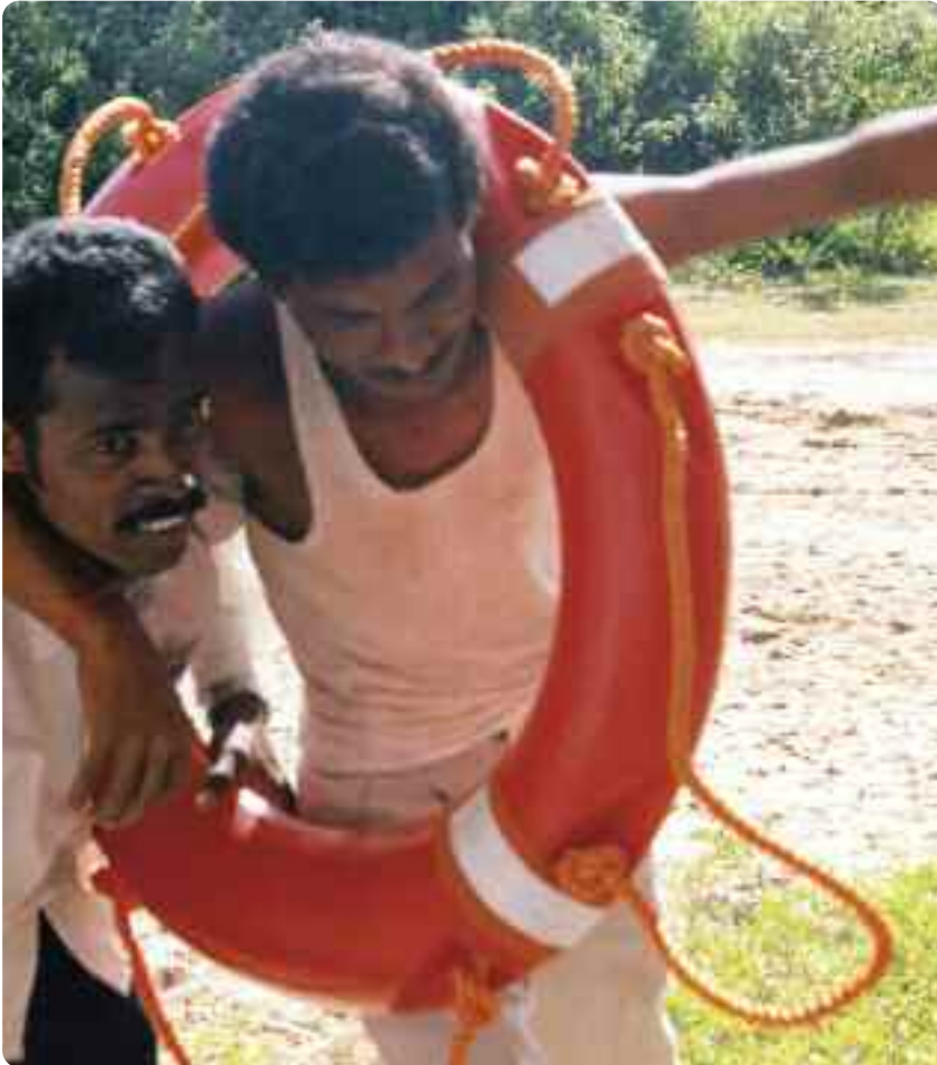
Preparing for disaster in Orissa, India.