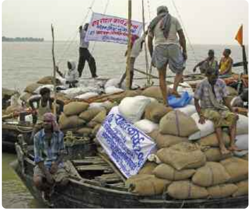
Bringing food to flood victims in India. Caritas India

Solidarity and the common good: In the Catholic tradition, the universal common good is specified by the duty of solidarity, "a firm and persevering determination to commit oneself to the common good", a willingness "to lose oneself" for the sake of the other instead of exploiting them. 24 In the face of "the structures of sin", moreover, solidarity requires sacrifices of our own self-interest for the good of others and of the Earth we share.