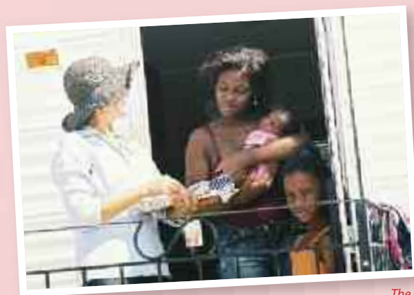
The CCUSA volunteers programme in Louisiana, where Hurricane Katrina struck in 2005.

Catholic Charities has a moral obligation to protect the life and dignity of each person and the established communities in which they have built their lives. We have a powerful network through which we can provide social services to people most vulnerable to the effects of climate change. We have a prophetic voice for justice that needs to raise climate change concerns to our statehouses, Congress, and the White House. Ultimately, our role is difficult because we are stewards of a world that is not our own. We are part of the biblical covenant obligating us to care for all of God's living creatures. If we believe that God is present in us and to us in all that we see and experience, then we must embrace the role of the good steward—a role that Catholic Charities in its commitment to the common good takes seriously as it finds its voice in the climate change debate.