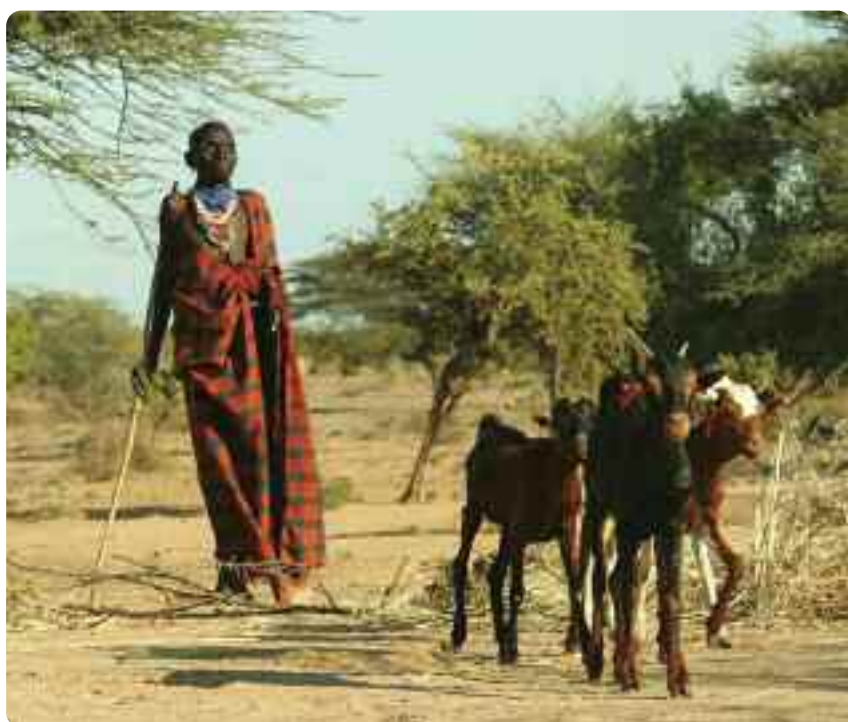
Kenya's pastoralists depend on cattle, but frequent droughts decimate herds and livelihoods.

Heat waves, especially in urban centres, cause deaths and exacerbate diseases, mainly in elderly people with cardiovascular or respiratory disease. In 2003, 37,000 people who could not escape brutal heat waves died in Europe. Changing temperatures and patterns of rainfall are expected to alter the geographical distribution of insect vectors that spread such infectious diseases as malaria and dengue fever. 17 ○