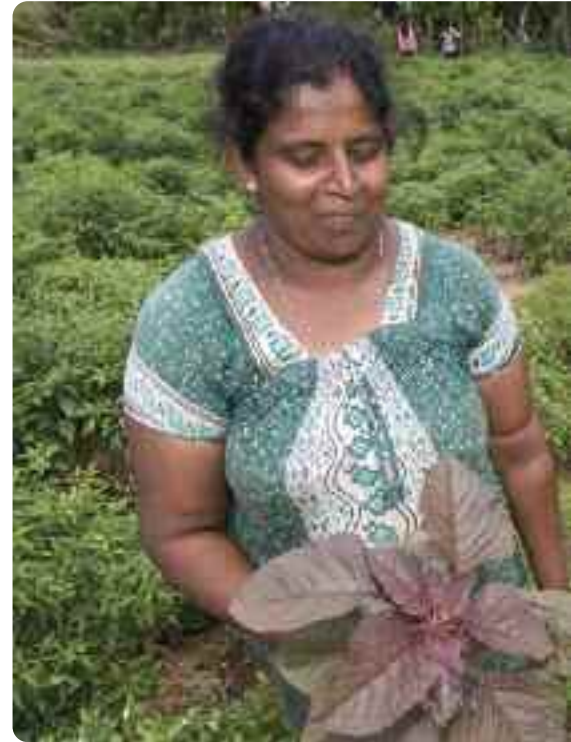
Caritas projects in Lebanon (left), Sri Lanka (top), and Zambia (right).